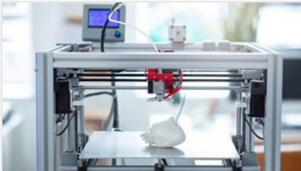
What Is Medical 3D Printing?